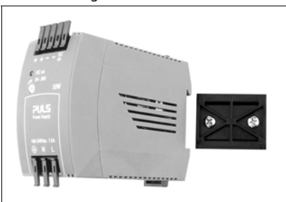
Fig. 1 Installation

Mount the bracket on the wall and click the unit onto the rail